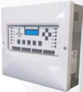
KP304 4 ZONE FIRE ALARM PANEL