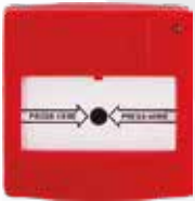
BA102 ADDRESSABLE MANUEL CALL POINT