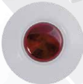
PL001 LED INDICATOR