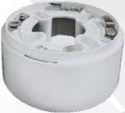
DT200 DETECTOR BASE