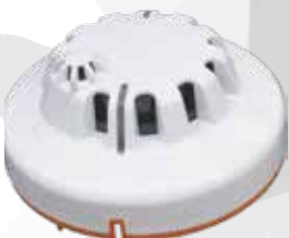
DA803 ADDRESSABLE COMBINED DETECTOR