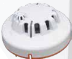
DA813 ADDRESSABLE COMBINED DETECTOR WITH ISOLATOR