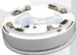
ST805 ADDRESSABLE SOUND ALERT BASE