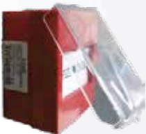
BK001 SEALABLE PROTECTIVE COVER