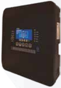
CO-016 ADDRESSABLE CARBONMONOXIDE PANEL