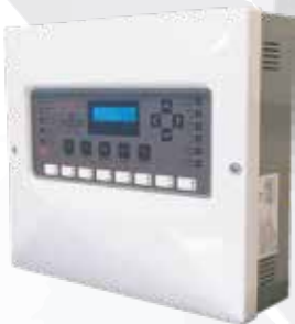
KP308 8 ZONE FIRE ALARM PANEL