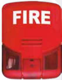
SO240R OUTDOOR FIRE SIREN