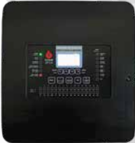
AP104 ADDRESSABLE FIRE PANEL