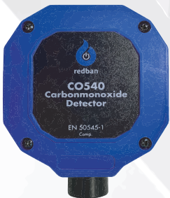
CO540 ADDRESSABLE CO DETECTOR