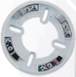
DT100 DETECTOR BASE