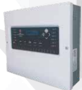
KP316 16 ZONE FIRE ALARM PANEL