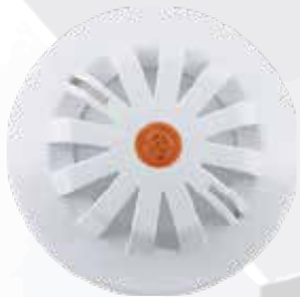
DA802 ADDRESSABLE HEAT DETECTOR