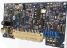
LK204 LOOP CARD