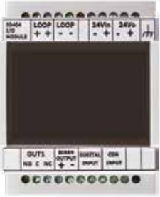
MA404 ADDRESSABLE 4 FUNCTION I/O MODULE