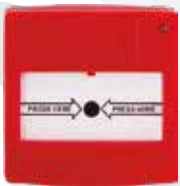
BA112 ADDRESSABLE MANUEL CALL POINT WITH ISOLATOR