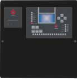
AP204 ADDRESSABLE FIRE PANEL