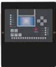
AP204-R ADDRESSABLE REPEATER PANEL