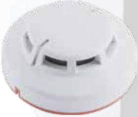
ED801 ADDRESSABLE OPTICAL SMOKE DETECTOR