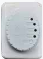
GS221 ADDRESSABLE GAS DETECTOR