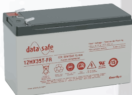
BC712 DRY BATTERY