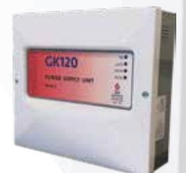
GK120 24V POWER SUPPLY