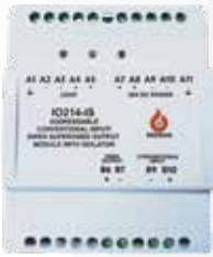
IO214-IS ADDRESSABLE 2 FUNCTION MODULE WITH ISOLATOR