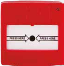
BK102 CONVENTIONAL MANUEL CALL POINT