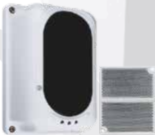
TX7130 BEAM TYPE SMOKE DETECTOR