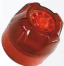
SK308-IP65 CONVENTIONAL SIREN WITH FLASHER