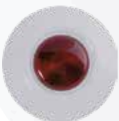
SA840 ADDRESSABLE SIREN