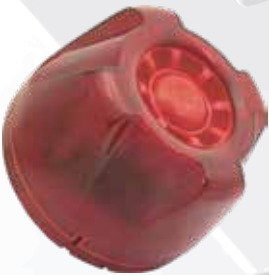
SK308 CONVENTIONAL SIREN WITH FLASHER